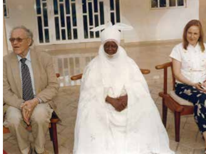
The Africanist with his daughter Therese and the Emir of Kaltungo. The two were in the Nigerian town in 2009 for a book presentation.

Jungrathmayr: Today, the synchronic aspect of language studies is much stronger than the diachronic [ comparing